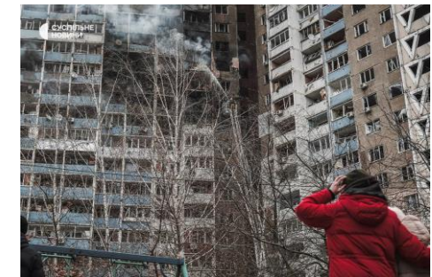
Zaporizhzhia and oblast