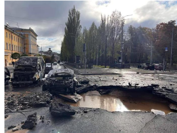
Kyiv center, 10.10.22